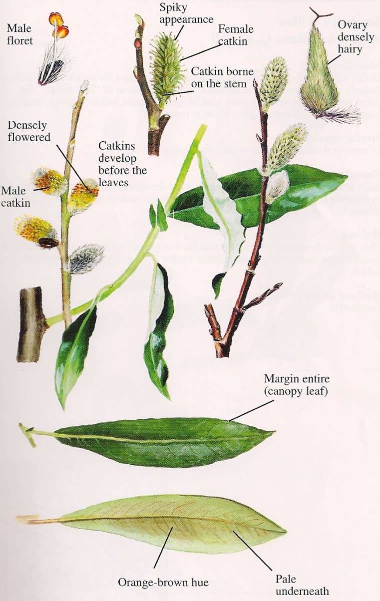
Collet, DM. 2004. Willows of Interior Alaska. US Fish and Wildlife Service - Yukon Flats National Wildlife Refuge. 70181-12-M692.