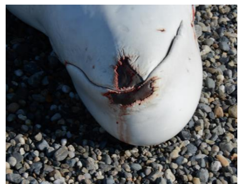
The tip of the rostrum, the skin had been abraded off.

On the right side of the head just above the upper jaw line, there were two puncture wounds (arrows) These did not progress into the underlying tissue (inconsistent with gunshot wound).