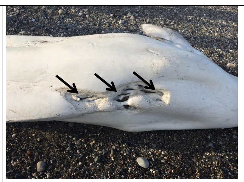
Dorsal wound initially

There was a large, irregular, 55 x 15.8 (widest) -7.2 (narrowest) defect on the dorsal midline just cranial to the dorsal ridge region. It measured and was characterized by very well healed defects or lacerations with several edges of skin having smooth edges. Between and under some of the defects was black necrotic, friable tissue. The pattern of the defect including several parallel and slightly curved lines going longitudinally and then three major indented areas running transversely (arrows)