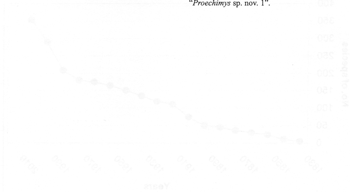
Figure 1. Cumulative number of native mammal species known in Bolivia. Last figure is from Anderson (1997). Notice the sharp increase at the year 2000.

Proechimys —The recent description of Proechimys gardneri included three specimens from two localities in Pando (Silva 1998), which makes it a new species for Bolivia. The specimens described by Silva (1998) were cited by Emmons (2002) as " Proechimys sp. nov. 1".