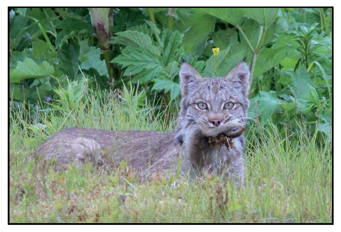
FIGURE 2. Adult Canada Lynx ( Lynx canadensis ) after capturing an Arctic Ground Squirrel ( Urocitellus parryii ) near Painter Creek (UAMobs:Mamm:239, 57.1591°, -157.4114°) in southwest Alaska, USA.

westernmost Lynx populations in North America. Potential habitats and additional records also suggest that Lynx occur, at least sporadically or ephemerally, throughout the entirety of the Alaska Peninsula (including areas that do not support Snowshoe Hares). ADF&G sealing records also support these observational data, and suggest that Lynx populations persist in the Naknek, Ugashik, Dog Salmon, and Mother Goose drainages (Table 1, Fig. 1). Reports of Lynx harvested south of the Meshik drainage (Fig. 1) were relatively rare, and no documented reports are known from south of Port Moller. Based on previously published information (MacDonald and Cook 2009), records presented here include some of the westernmost records of Lynx and extend the published distribution of the species by approximately 380 km or more along the Alaska Peninsula. However, an important and often overlooked aspect of species range limits is that these limits are often dynamic (even at short timescales), and thus,