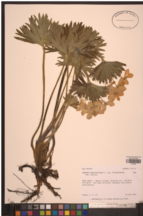
Villosissima 2 – 27902